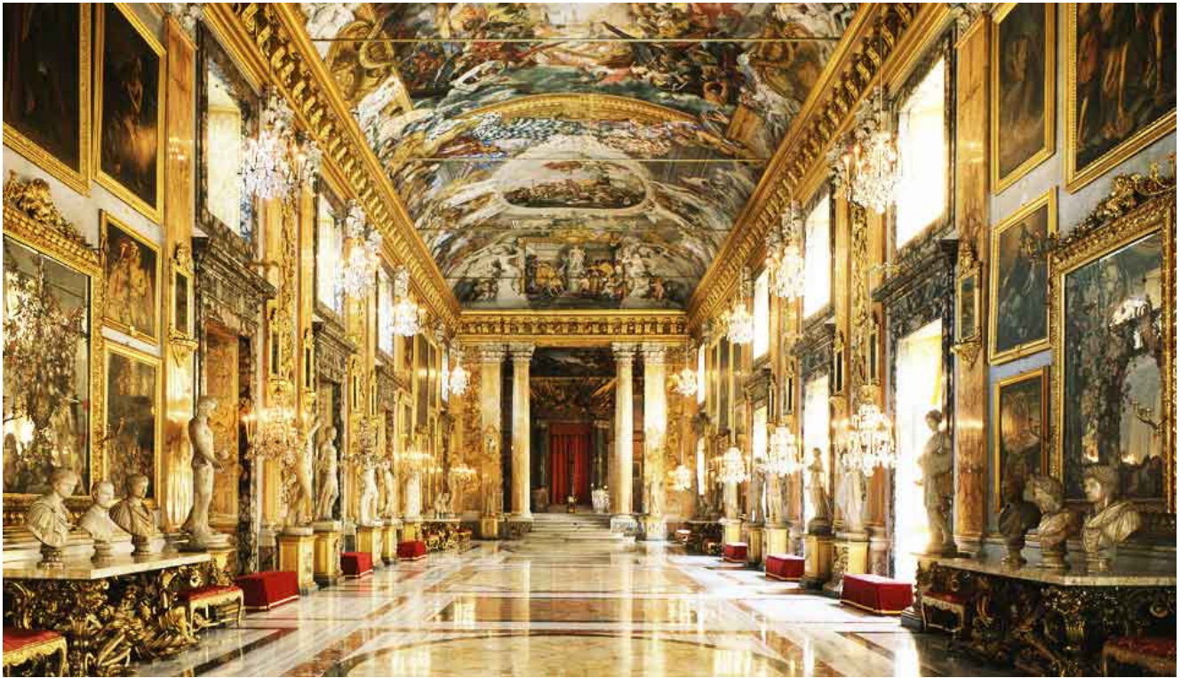
BAETS had their Gala Dinner at the breathtaking Palazzo Colonna Museum, Rome