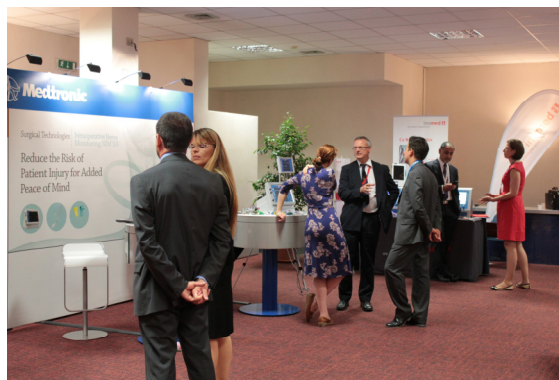
Industry Exhibition at the BAETS 2013 Annual Scientific Meeting, Rome

The 2013 BAETS Annual Scientific meeting in Rome was a joint venture with the Italian Endocrine Surgeons, hosted by the Department of Surgery, Università Cattolica del Sacro Cuore.